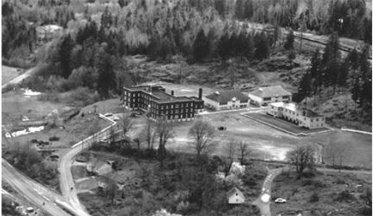
United Church's Alberni 'Indian Residential School', 1964

Soon, the noon bell sounded along with a cacophony of dutiful, regimented footsteps.